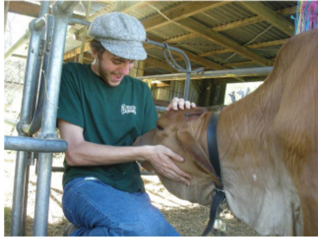
The author and Sona the cow at Om Shree Dham, Australia

A volunteer will have his or her ups and downs during a stay. That is natural. And it is natural that you will relate more to certain people than to others. Difficulties and differences may come up at some point. Reach out and open up to others and work through the