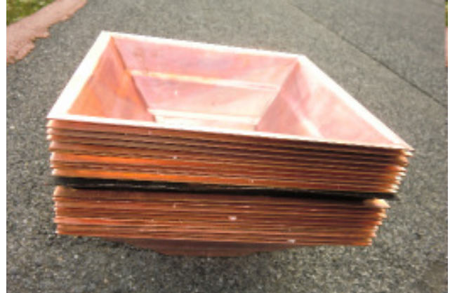
Above and below: Warped pyramids that need re-pressing. Below right, a repaired pyramid.

Similarly, when an Agnihotra pyramid falls on the ground and a corner is bent, you can either use the same method, or you can put the edge with the bent corner on some hard wood and then exert some pressure so that it will be even again. The main thing is that when you look along the top edge and along the sides, they must be straight. Also when looking from above into the pyramid, all sides should be square to each other (90 degrees).