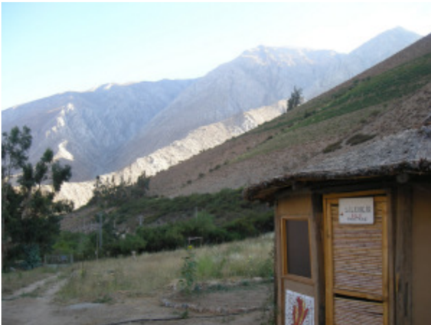
Agni Shala at Bhargava Dham in Elqui Valley, Chile

I have been a lover of nature and the outdoors all of my life, and fond memories of childhood summers spent on my uncle's farm in northern Ontario left me with a desire to learn how to live a life close to the land. I have learned many of the things I needed to through HHOOFFing: farming, gardening, caring for and milking cows, pruning of fruit trees, growing and wild-crafting medicinal herbs, property maintenance, carpentry, vegetarian cooking--I have learned all of these during my stays.