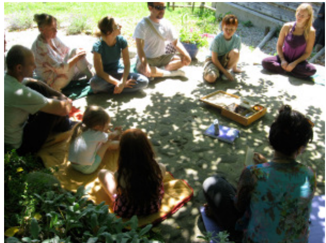
Sunday Satsang at Bhrgu Aranya, Poland

This I attribute to the Vedic healing fires performed daily at Homa farms. They are the purpose, foundation and reason these places exist. Proper timings, Sanskrit pronunciation, the ingredients and performance of the fires, Agnihotra being the first and most important fire, can be learned at any of the centres from qualified, long-time practitioners of this ancient healing science. A Homa farm is the perfect setting in which to learn Agnihotra, as the atmosphere is already permeated by the effects of fires done over years in one place. This creates a deeper and more powerful experience of the fires. To stay at a centre can be a transformative experience. The fires provide us an atmosphere that nourishes and encourages self-development.