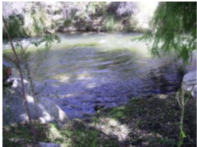
Cochiguaz River, Chile