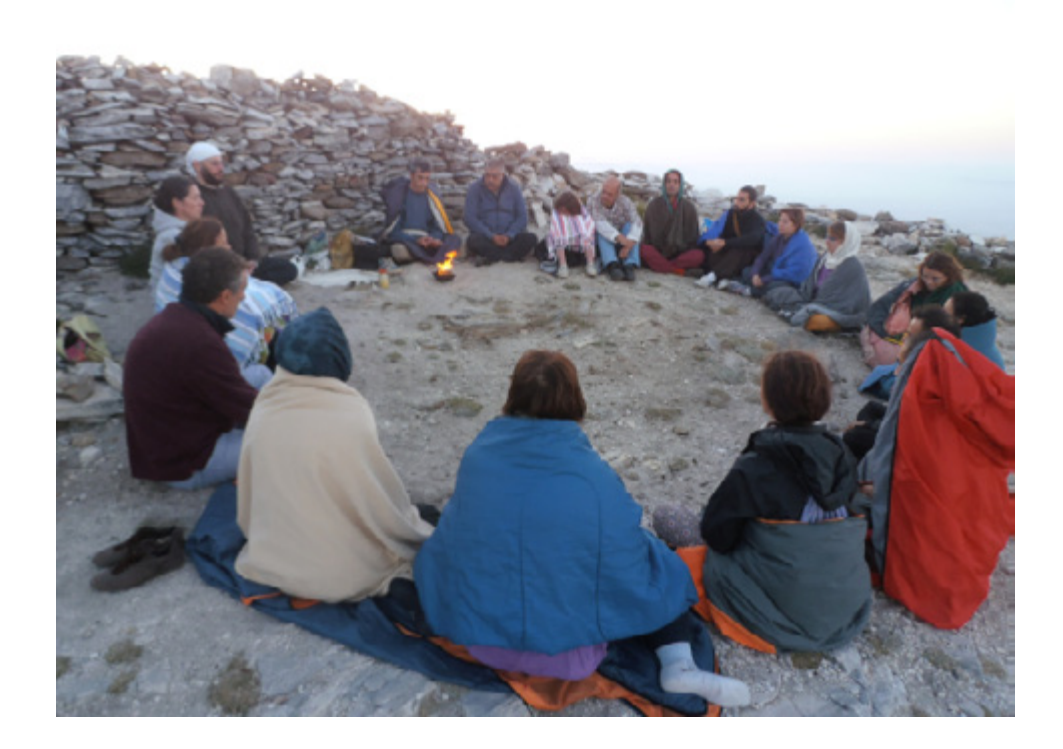
Agnihotra at Ancient Divine Mother Mountain