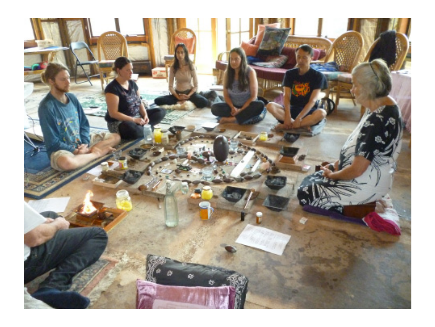
Australasian Agnihotra Teacher Training Course