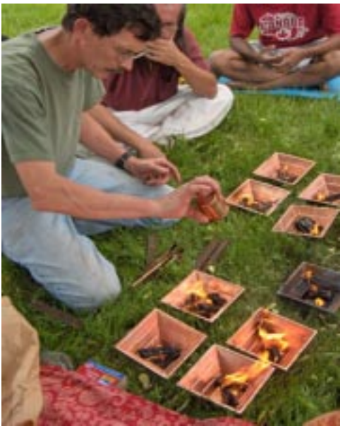
Performing Purusha Sukta

We decided on the best spot for the central pyramid and performed the Resonance Point