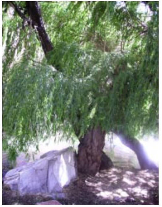
By the Cochiguaz River, Chile

Let's keep the fires burning and continue sending Light to these points, thus helping to restore the harmony and balance on Earth. Let's keep the sacred fire burning constantly, not only at the physical level, but in our hearts and souls!