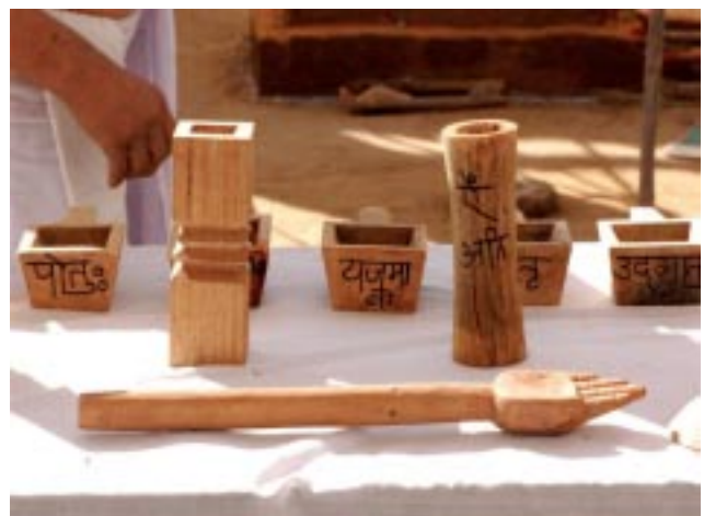
Above and right: implements used in Somayag