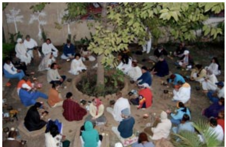
Group Agnihotra in the courtyard