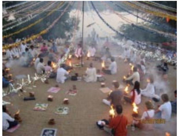
Above and left: Agnihotra in the newly-built amphitheatre overlooking the Narmada River