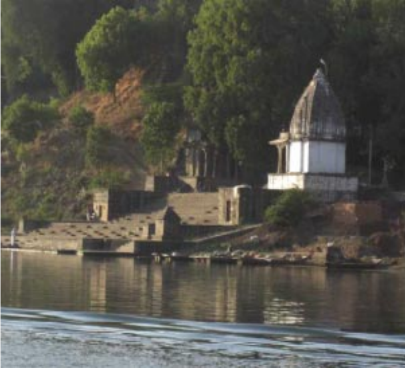
View from Narmada boat procession