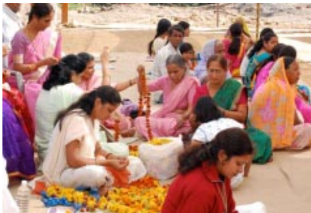
Ladies making flower garlands to decorate the Somayag area