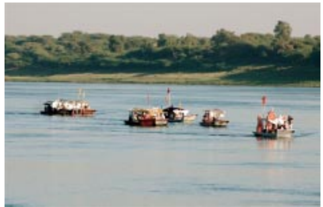
Floating procession down the Narmada